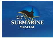
RNSM Summer Evening Visits